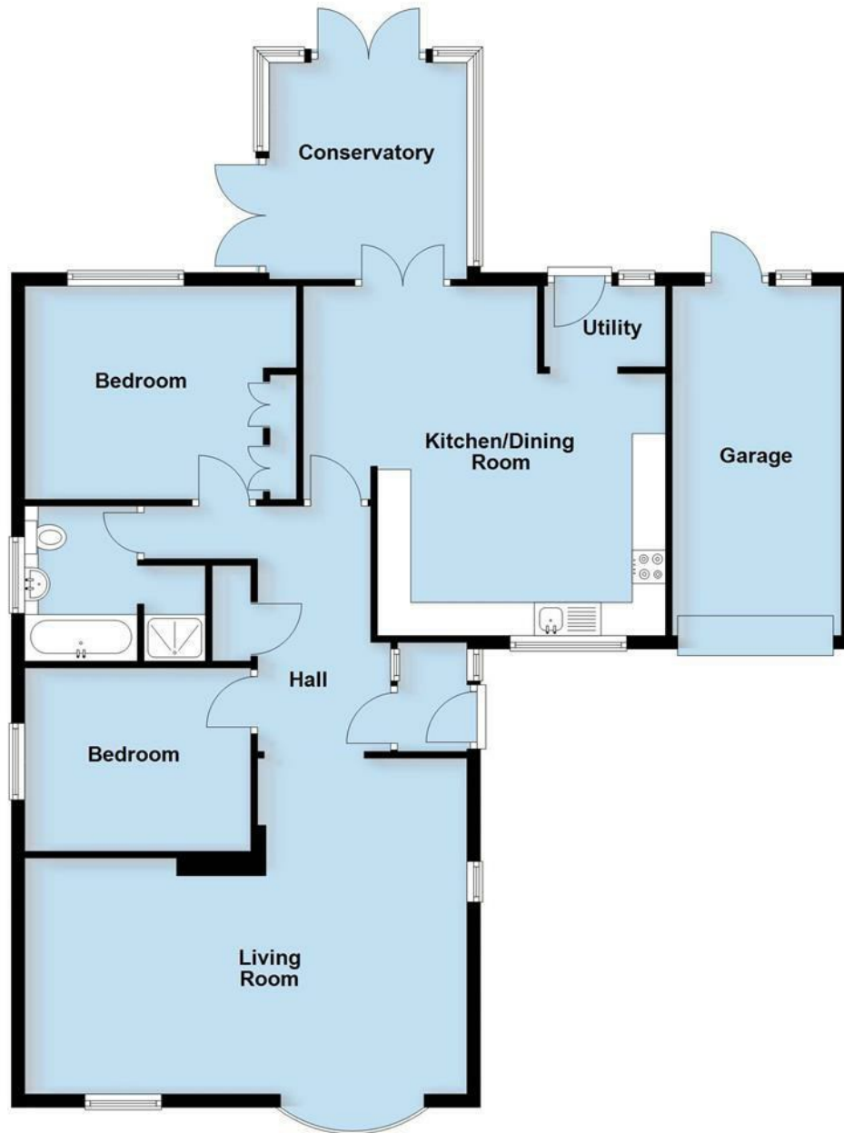
Total area: approx. 120.5 sq. metres (1297.3 sq. feet) This plan is for illustration purposes only and should not be relied upon as a statement of fact